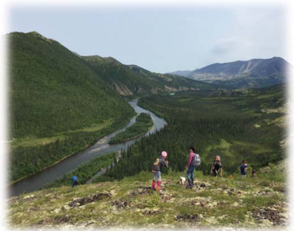
Together we hiked to the Stone Woman—one of the toughest hikes on one of the hottest days! All camp members made it to the Stone Woman, even the babies!