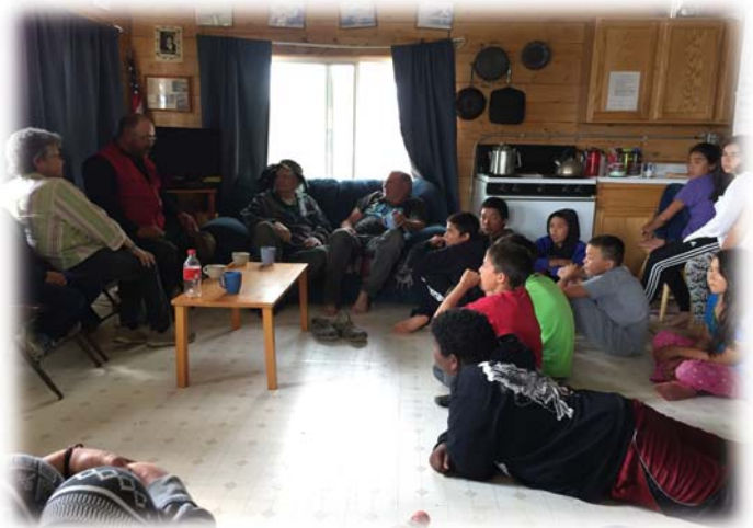
Youth sitting quietly as they listen to the elders.